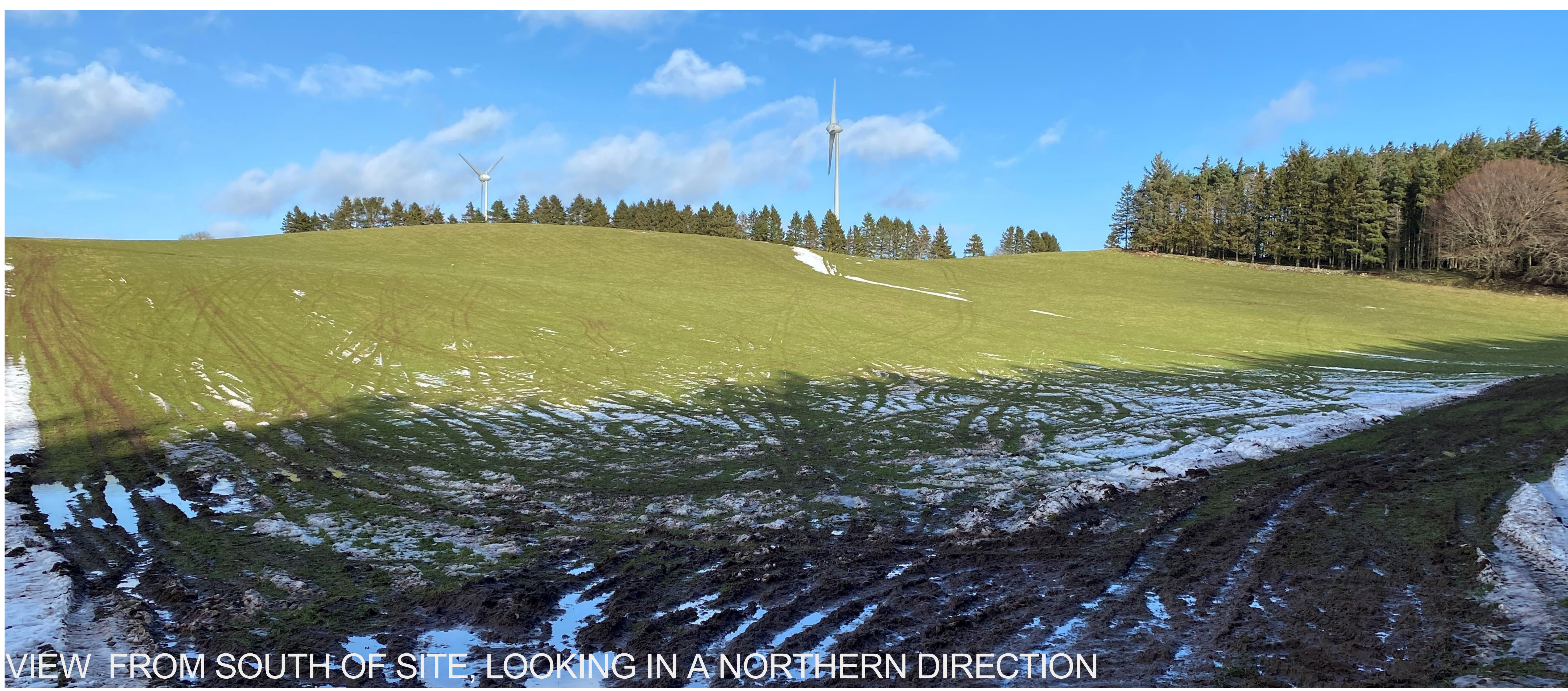
VIEW FROM SOUTH OF SITE, LOOKING IN A NORTHERN DIRECTION